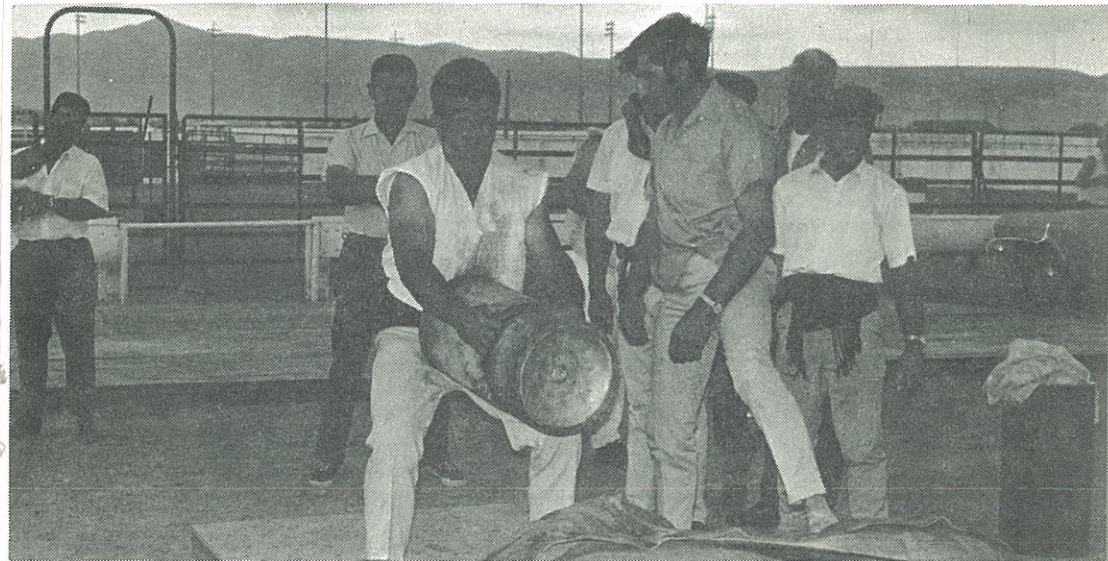
JUAN VICANDI, 1970 CHAMPION WEIGHTLIFTER