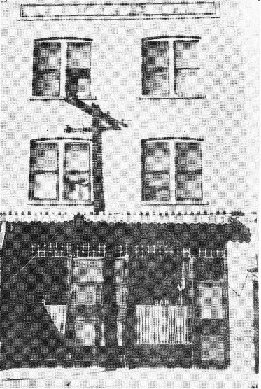
Elko's Overland Hotel, on Fourth Street, long-time Basque social center.