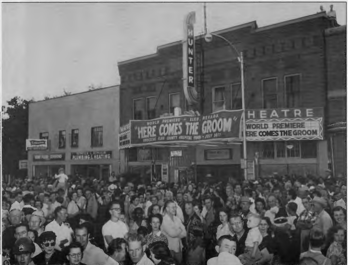
A crowd in front of the Hunter Theater, awaiting the arrival of the movie stars for the world premier of Here Comes the Groom.