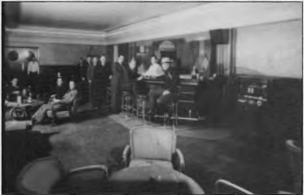
Another view of the early lounge at the Commercial Hotel.