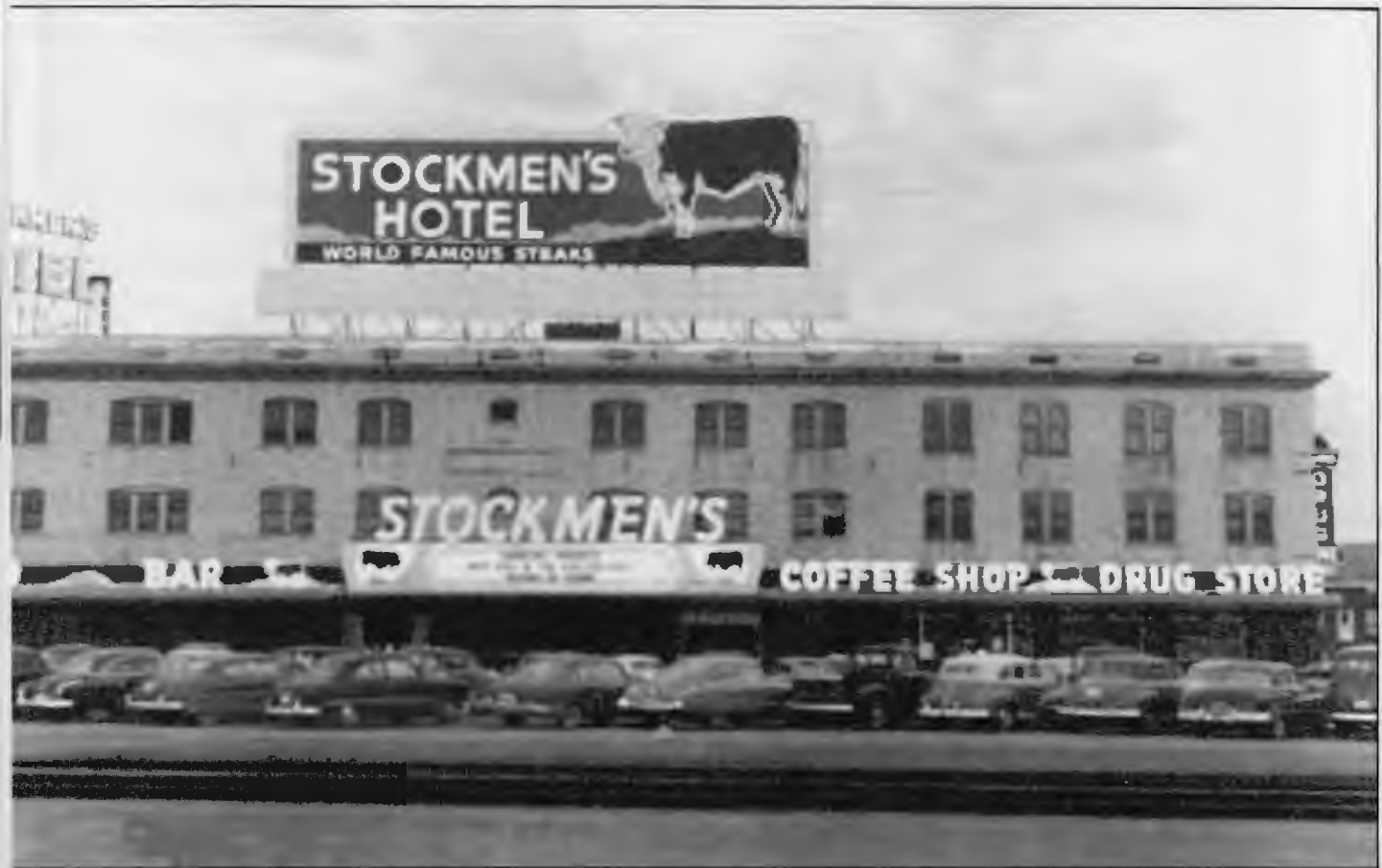
The Stockmen’s Hotel, the second establishment to feature big-name entertainment in Elko.

The Intermountain West’s biggest professional rodeo came to Elko in 1948 and the First Annual Silver State Stampede was not exclusively a local show; it was also sponsored by several casinos in other Nevada towns. Bing Crosby, Elko’s Honorary Mayor,