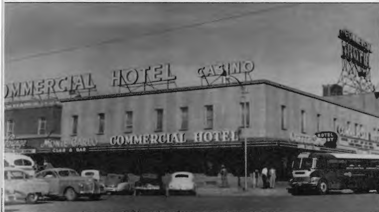
The Commercial Hotel, at approximately the time Newt Crumley started bringing in big-name entertainment.

That successful merging began in 1937 when Newton Crumley opened the first lounge in the Commercial Hotel. Although the hotel bar had been open, even during periods of prohibition, the new addition was Elko's first sophisticated cocktail lounge. There was a small dance floor in front of an alcove where three or four musicians held forth entertaining bar patrons and dancing couples. The popularity of the room led Newton