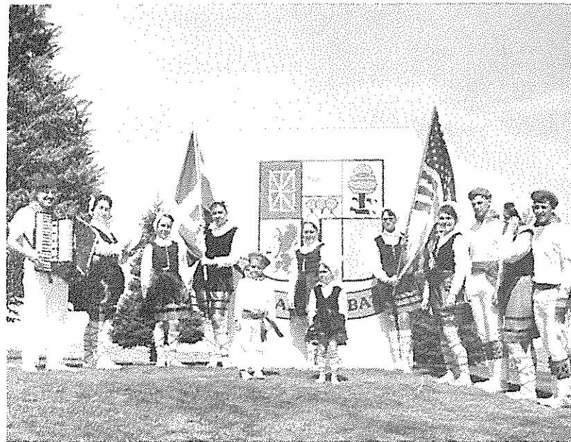
THE ELKO EUZKALDUNAK CLUB

The Elko Euzkaldunak Club was first organized in December 1959 with a membership of approximately 42 people.